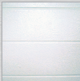
Ribbed Panel Design

Panels are preprimed inside and out to inhibit rust. Hot-dipped, galvanized steel is painted with primer and given a tough oven-baked polyester top coat, to provide the most rust-resistant steel door available. Ten year warranty against rust-through.