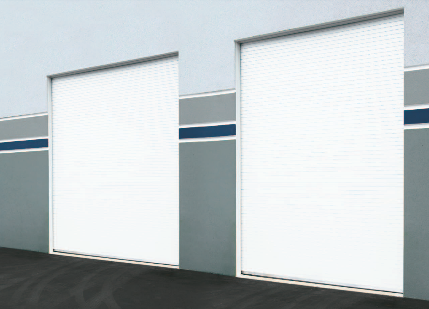
Model CMD16, Rolling Steel Door