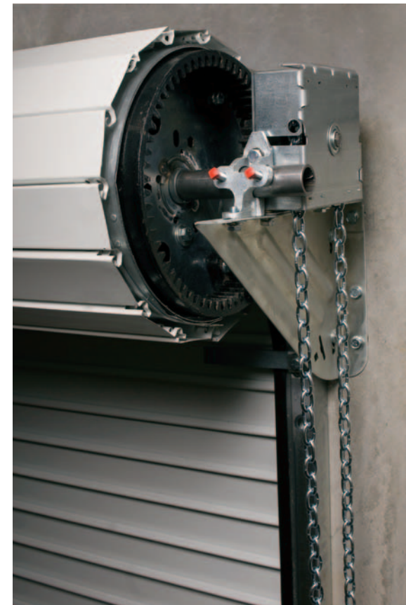
Chain hoist motor operation

Installation: Clopay rolling steel doors shall be installed and adjusted according to factory installation instructions by trained door system technicians.