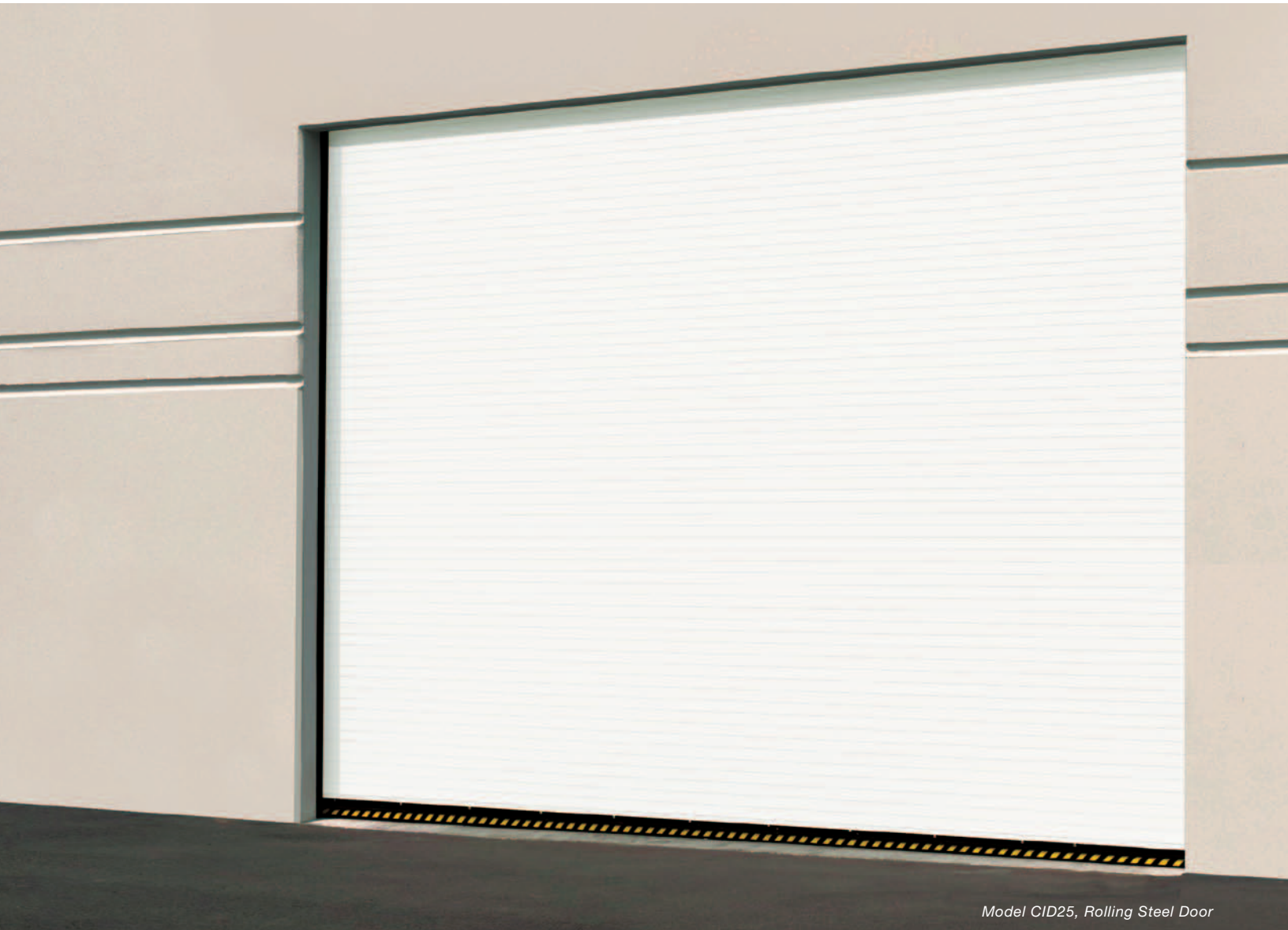
Model CID25, Rolling Steel Door