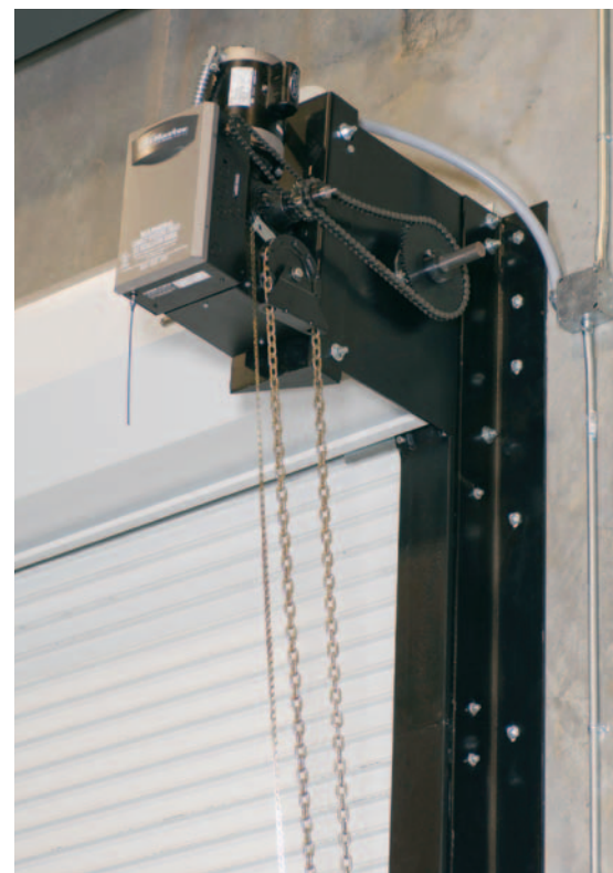
Chain hoist motor operation

Installation: Clopay rolling steel doors shall be installed and adjusted according to factory installation instructions by trained door system technicians.