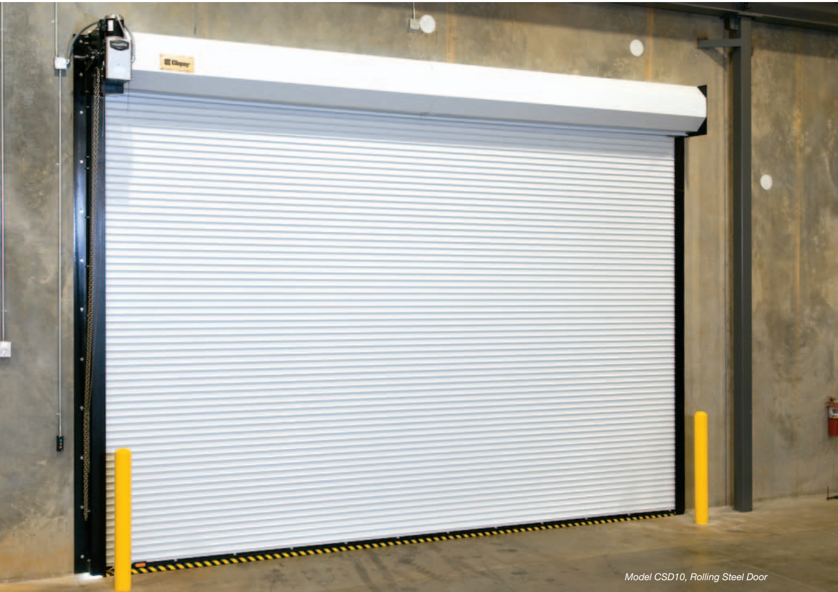
Model CSD10, Rolling Steel Door

CID25 A new pinnacle in insulated service door design. The CID25 clearly demonstrates that combining the high yield insulating qualities of polyurethane with reduced weights and enhanced operational abilities can produce a truly high performance industrial product. In addition to insulation, the CID25 is fully weatherstripped with a hood baffle, vinyl blade guide seal and soft, wide bottom bar astragal. The CID25 matches the CSD20 in operational and life-cycle characteristics with an efficient and full duty service life.